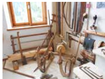
Costums and Traditions Museum

The museum, recently restored, narrates the working place and the housing of the Valley. A scale model represent a "tabià", with the phases of the transformation. The material gathered here is local