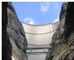
The Vajont Dam

The dam, symbol of the tragedy, is located on the Vajont gorge, 7 km away from Longarone and close to Erto and Casso. It was built at the end of the 50's and it resisted the force of the wave on the 9th of October 1963. Nowadays, the dam is opened to the public with guided tours and access to the walkway along the top.