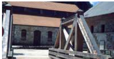
Valle Imperina mining center