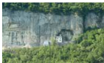
"San Micel" hermitage

It is a construction placed in a little recess near Fonzaso, where the guardian of the village once lived.