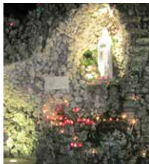
Cave with an Our Lady of Lourdes statue

This cave is situated in Cima Loreto, on the western side of the Mount Avena. It is an interesting location that you can reach from Faller, following the path to get to Ramen and continuing for a few minutes on a path recently repaired