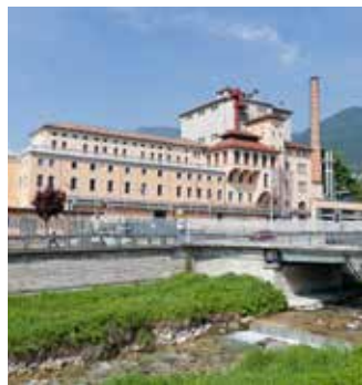
Eremo de San Micel