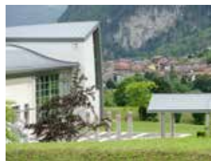
Monumental Cemetery Vajont

It is located in Fortogna, 5 km south Longarone, it was built after the tragedy to host the remains of the victims. Recently It has been renovated and expanded and it was designated national monument in 2003. The cemetery is always accessible through the lateral entrances, the main Gate is open to the public on public holidays..