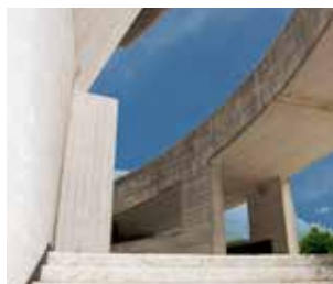
Monumental Church Vajont

It is situated in J. Tasso Square, in the centre of Longarone. Built after the tragedy, following the architect Giovanni Michelucci's project, the church is dedicated to the victims of Vajont. Outside it is always possible to visit the Memorial to the Victims and the Museum Pietre Vive.