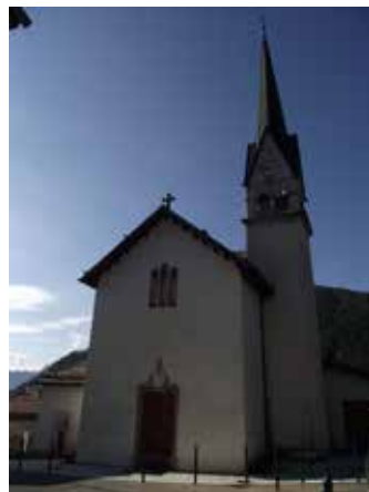
CSaint Anne Chrucl