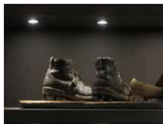
Iron and Nail Museum in Forno

Starting from some elements linked to the past of the Zoldo Valley and continuing with some material and historical sources, recently we've been able to investigate on the works "Fusine a cavallo", between the nineteenth and the twentieth century. In this period, the blacksmiths specialised in the production of nails, but soon this job was abandoned.