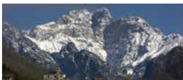
Sass de Mura