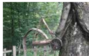
The bike on the tree in Sitrán

There are many popular legends about the bike on the tree. The bike is actually there, perhaps it was tired to serve the men and it retired in the woods.