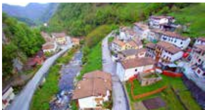
Borgo Valle Schievenin

The climbing wall in Schievenin is one of the best in Veneto, for the quality of the rocks and the beauty of the view. Many climbers daily attend the wall for practise. Thanks to its exposition to the sun it is possible to climb in winter too.