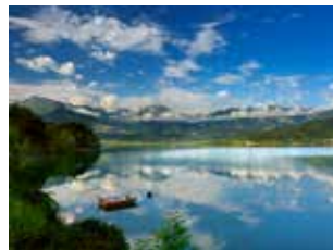
Santa Croce Lake

The Santa Croce Lake, whose basin has been artificially expanded in the 30's, is a natural lake located in Alpago, on the border with Treviso. The climate, sunny and not too warm thanks to the constant breeze, allows pleasant strolls, bike excursions and relax on the beach. The value of the lake is represented by the fact that Legambiente, for some years now, confers Farra d'Alpago and its lake four sails, out of five sails on its "Guida Blu" classification, which evaluates the quality of the Italian bathing sites.