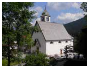
Saint Tiziano Chrucl

This church is situated in Goima, in a special zone of this valley. The building dates back to the 15th century, when frair Franceschino da Forlì obtained the approval to build ex novo the church, that became parochial church in 1726. The current building was restored many times, and on the inside you can see important works of art.