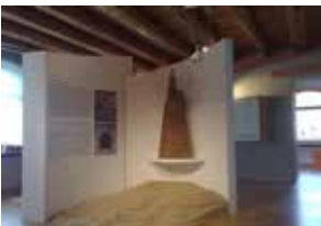
Museum in La Valle Agordina