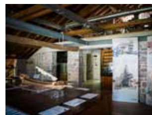
Museo regionale dell'Uomo in Cansiglio

The Museum is owned by Veneto Agricoltura and is a collection of documents and evidence of man in Cansiglio and his relationship with the Plateau, starting from Prehistoric times. Here you can find historical records concerning the Venetian domination and the presence of an ethno-linguistic minority group, the Cimbri. There are also panels about forestry activities, the preparation of coal and the timber processing. There are many tools in exhibition. They were once used to turn the beeches of the Cansiglio forest into oars that were used to pilot the ancient Venetian galleys, huge boats that all the fleets in the Mediterranean Sea feared. These tools were also used to create the "scatoi", circular containers destined to the conservation of cheese and food. The food was produced by a German speaking population, the Cimbri. They arrived in the area at the end of the eighteenth century.