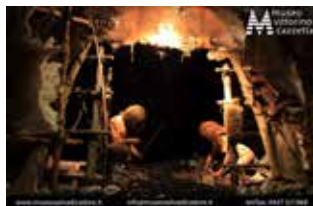
"Vittorino Cazzetta" museum

The "Museo Civico della Val Fiorentina V. Cazzetta" is in Selva di Cadore, a wonderful tourist destination composed by small ladin villages 1300 meters above the sea level. The museum gathers the archaeological, palaeontological and historical samples found in the Valley and its surroundings. Among them, the most important are the "Skeleton of the Man of Mondeval" (VI BC) and the cast of the rock of the Monte Pelmetto, with the footprints of three different species of dinosaurs impressed on it (the first and the most ancient in Italy). In summer, you can visit the Volunteer Firefighters Museum. Then, you cannot miss Colle Santa Lucia and the Passo Giau.