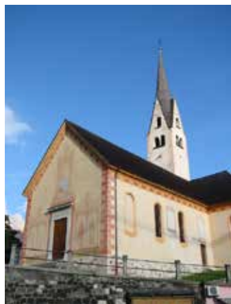
"San Nicolò" Chrucl