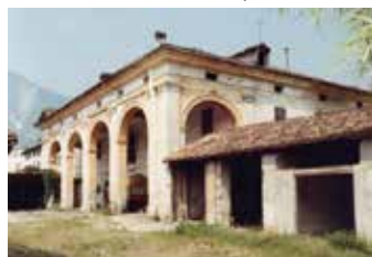
Villa De Pantz

Many villas built in the eighteenth century show the magnificence of this village and they are also archaeological evidence that belong to the Veneto's cultural heritage.