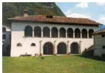
Villa Tonello Zampieri

The villa is located in Arten. It was built in the sixteenth century. There are stables that date back to the seventeenth century, whose loggia is decorated with frescos by Pietro de Marascalchi.