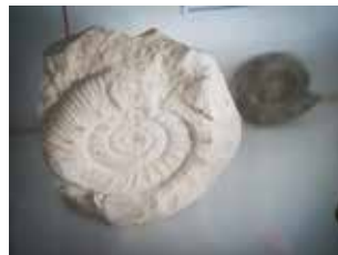
History and nature museum