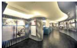
Museum Longarone Vajont

Situated since 2009 in the headquarters of the Longarone Cultural Centre, the museum is a mean to know the local history, indelibly marked by the greatest Italian tragedy in the post-war. Through pictures, evidences and multimedia totems we can go back over the history of the village before Vajont, the building of the Dam, the disaster, the rescue and the reconstruction of the present Longarone.