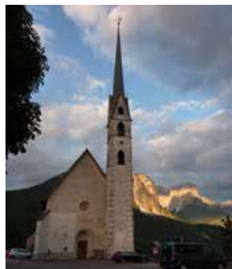
"San Floriano" Parochial Church in Pieve di Zoldo