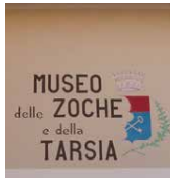
Museo delle Zoche

In San Gregorio delle Alpi the Museum of the Zoche (stumps), the Tarsia (inlay) and the ancient prints. Three hundred wooden artworks are exposed on the top floor and one hundred ancient prints, that date back to 1500, are exposed on the ground floor. It is open every Sunday from 3 p.m. to 6 p.m. You can book a visit by calling this number: 338 8375256. In the town centre there are the Monument dedicated to the Fallen on the job and the emigrant and the Boulevard of the dead lamps to commemorate the fallen miners. In the parish church you can admire an altar table made by Moretto from Brescia. Paderno hosts a remarkable historical and architectural heritage, with the Castle and the numerous villas. The mountain lovers can easily reach the Rifugio Ere ( 1297 meters above the sea level) and the Mount Pizzocco ( 2186 mteres above the sea level).