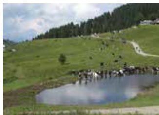
Basin of the Bocchette

The basin is situated on the north side of the Massif, it is a unique habitat for the flora and fauna. You can walk paths surrounded by nature and history. Here you can find a lot of Alpine cottages and mountain huts.