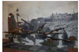
Museo Storico 7° Reggimento Alpini